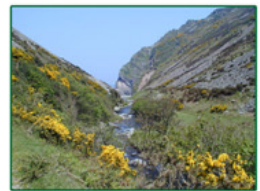
Heddon's Mouth by Ione Willcock